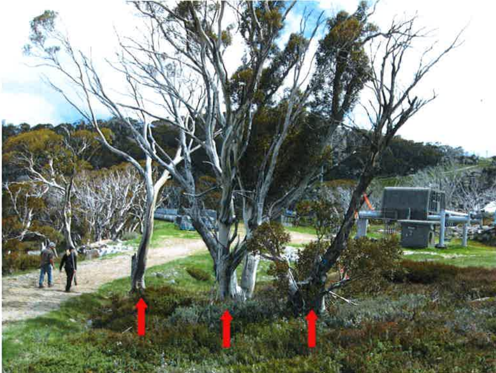
Photograph 2: The three trees proposed to be removed.

The applicant seeks development consent to remove three trees at the base of the Zali's ski run at Blue Cow, within the Perisher Range alpine resort.