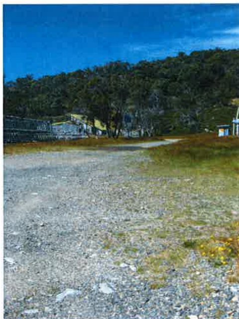
Photograph 3: Existing access track to the site.

Construction – Access to the site for construction vehicles and machinery is available from Blue Cow road and the existing access track. All vehicles and machinery will be contained to the existing access track during works.