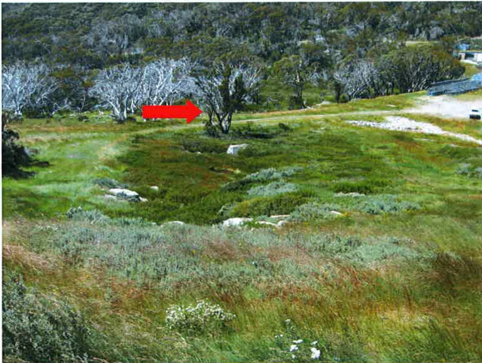
Photograph 1: View of the island of alpine bog at the base of the Zali's ski run, with the three trees to be removed marked.

The three trees proposed to be removed are located at the base of the Zali's ski run, on the edge of an island of alpine bog vegetation.